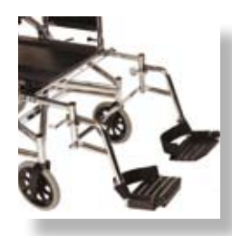
Swing Away Footrests Option No. HRA92 5.5" Horizontal adjustment 5" Footboard adjustment